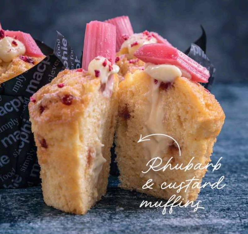
Rhubarb & custard muffins