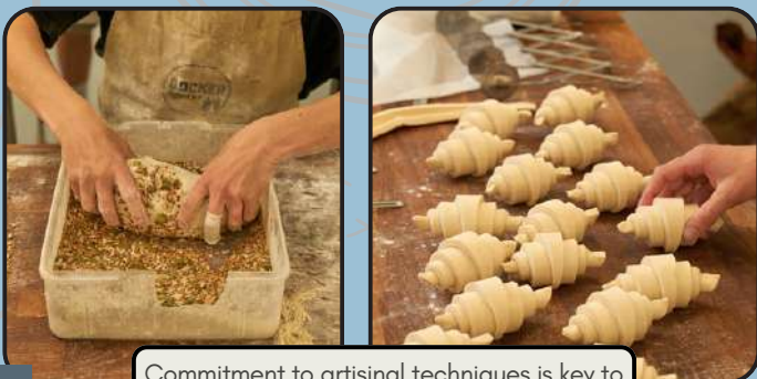
Commitment to artisanal techniques is key to the Docker ethos and brand identity.

We post regularly, and it's been a very effective way of building a loyal community around the brand.