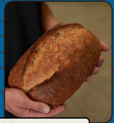
The current iteration of Docker's ever-evolving, iconic Cruffin (L) and their classic sourdough Country Loaf (R)

MTB: How much do you use social media and has it proved to be a good promotion tool?