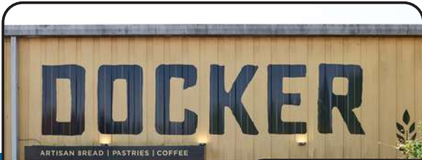
Docker's Folkestone bakery and retail location shopfront