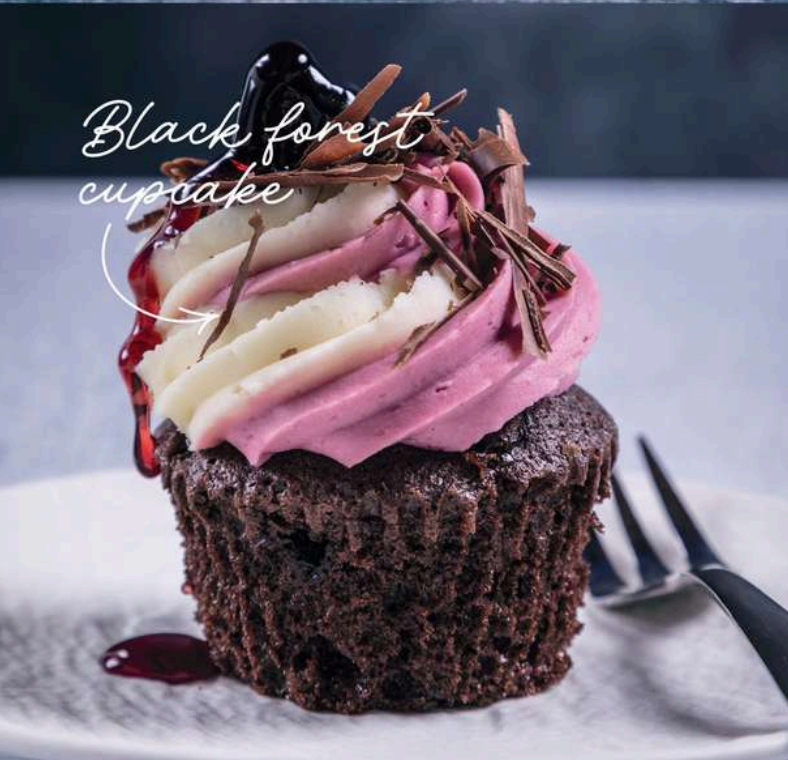
Black forest cupcake